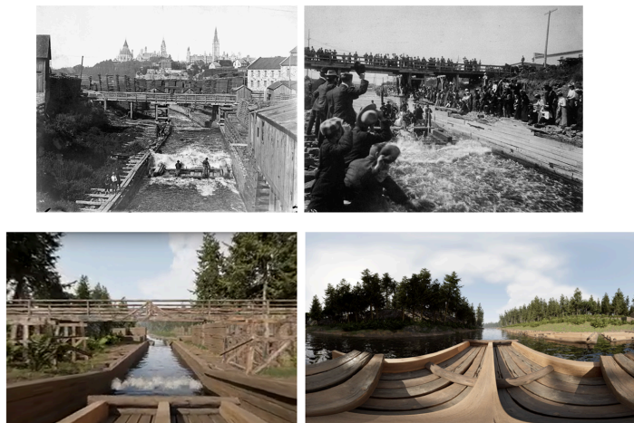
Note. Figure 2 includes “Timber Slide Chaudiere Falls,” 1890, “Timber Slide,” 1901, and screenshots from The Ottawa River Timber Slide (Clifford et al., 2024a).