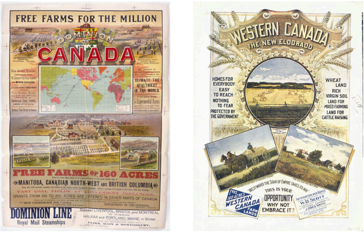
Note. Figure 3 includes historical artifacts from the Library and Archives Canada (1893, 1908).